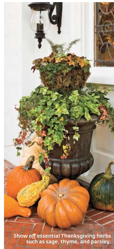
Show off essential Thanksgiving herbs such as sage, thyme, and parsley.