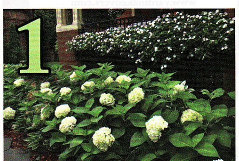
Hydrangea macrophylla 'Blushing Bride'