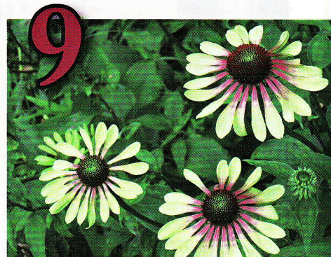
Echinacea purpurea 'Green Envy'

Noack Rosen, the German hybridizer behind all the roses in the award-winning Flower Carpet series, bred the new Amber. Like all Flower Carpet roses, once established, Amber is drought tolerant, disease resistant, and easy care, requiring no fancy fuss or pruning. It has tolerance for heat, humidity, and cold.