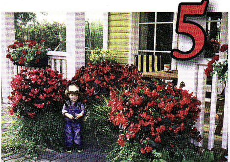
Begonia x benariensis 'BIG'™

There are five colors available in the series: 'Coral Rose,' 'Mix,' 'Scarlet,' 'White,' and 'Yellow'. It reaches a height 12-18" and spreads 12-18".