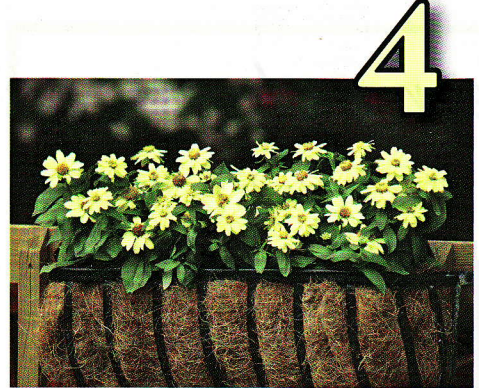
Zahara™ Zinnia