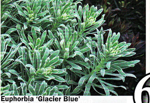
Euphorbia 'Glacier Blue'

This annual thrives from full sun to shade and grows to 12-18". It is early flowering with large, showy blooms as big as three inches across. The deep green or bronze foliage add vibrancy and contrast to the striking red or rose colored flowers. It has an upright arching habit perfect for window boxes and hanging baskets.