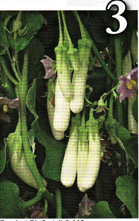
Eggplant F1 'Gretel' © AAS

Self cleaning, no deadheading necessary. Laguna does not like "wet feet." Be sure that you do not keep the soil wet. Allow the soil surface to dry before watering again. It combines well with nemesia and verbena hybrids.