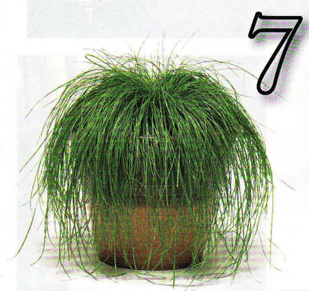
'Elongata Zephyr'

It takes full sun to part shade. It reached about 12-15" with a spread of 18". The bloom time is February to May.